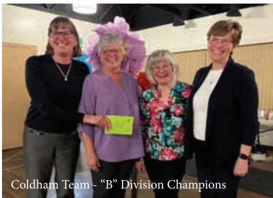
Coldham Team - "B" Division Champions