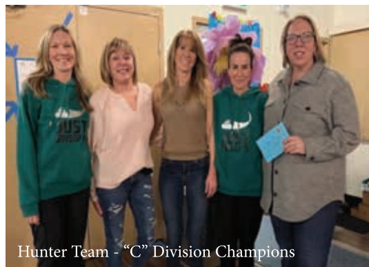
Hunter Team - "C" Division Champions