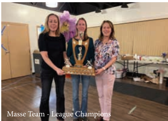
Masse Team - League Champions