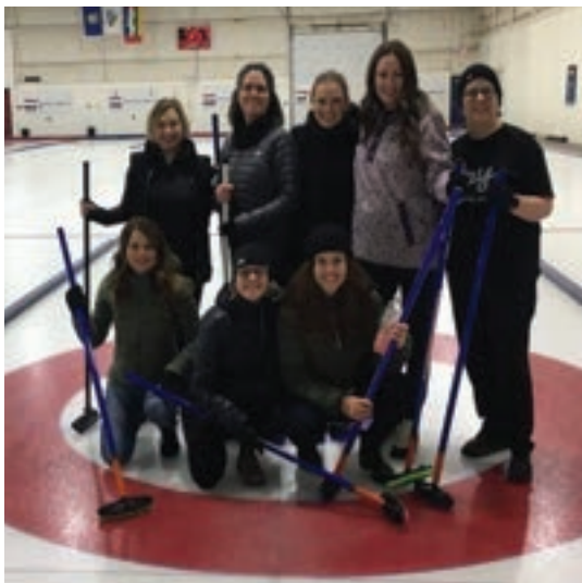
Ladies out enjoying SPFAS curling facility rentals!