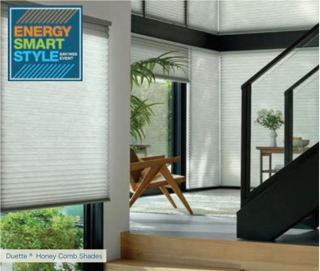
Duette® Honey Comb Shades