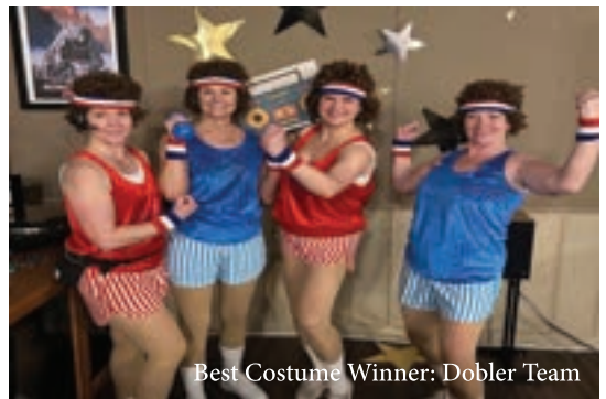
Best Costume Winner: Dobler Team

Curling is a great way to meet people and make friends while playing a sport you can play for a lifetime. Please visit our website at www.springbankcurling.com to find out more or to sign up!