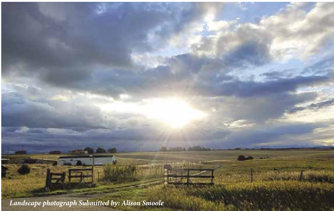
Landscape photograph

This location is geared for "seniors" with a level entrance and lots of parking etc.