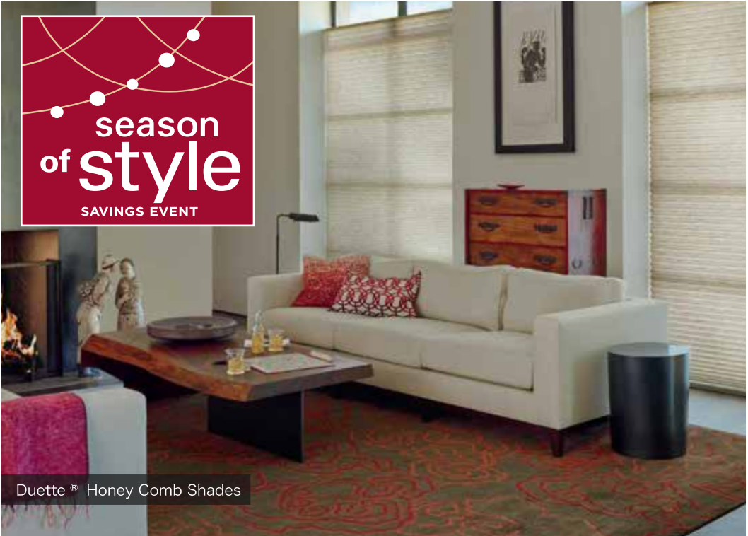
Duette® Honey Comb Shades